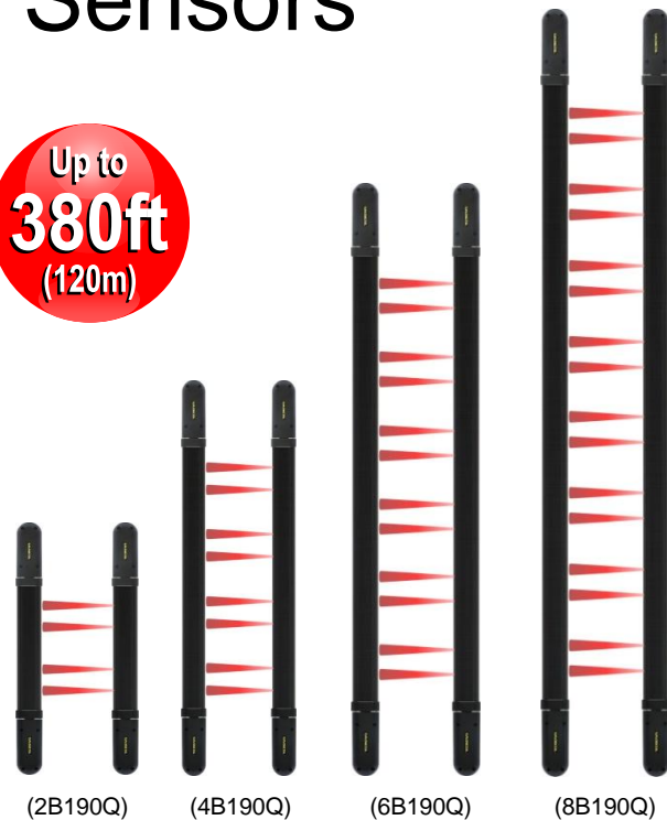
(2B190Q) (4B190Q) (6B190Q) (8B190Q)