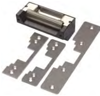
Universal Door Strike SD-996-NUQ