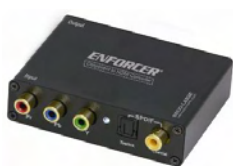
Component to HDMI