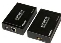
HDMI over Cat5e/6