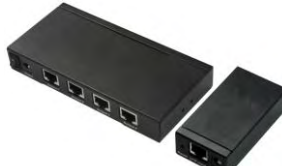
VGA over Cat5e/6