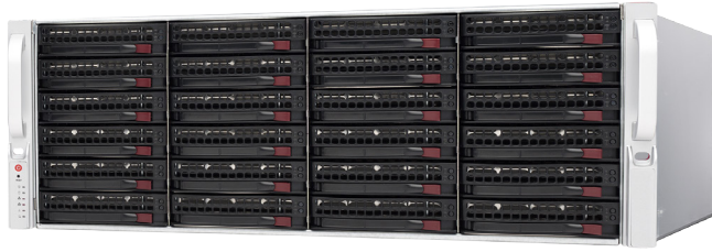
DW-BJE2U DW-BJER2U DW-BJER3U DW-BJER4U (shown)