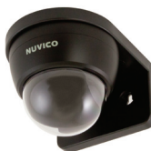
CD-WMB200 (Black) Indoor Wall Mount