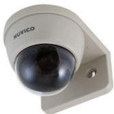
CD-WMI200 (Ivory) Indoor Wall Mount