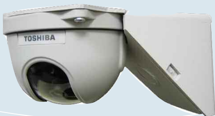
Optional wall mounting bracket