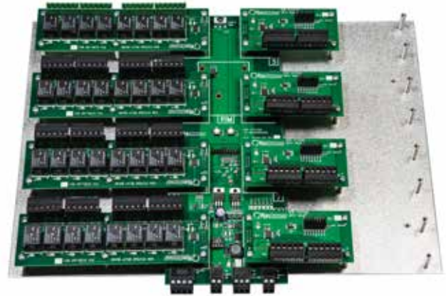
Unit shown with and without enclosure (available in both configurations)