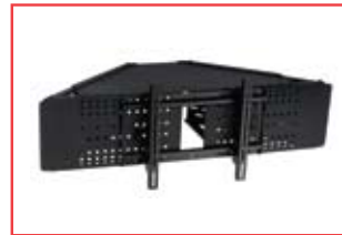
Optional shelf available for A/V components