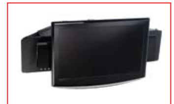
Wall units accommodate speakers when used with smaller screens

Peerless Industries, Inc. 3215 W. North Avenue, Melrose Park, IL 60160