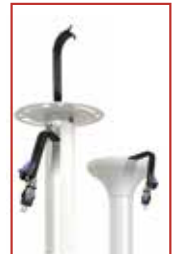
Internal cable management