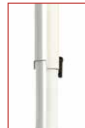
Tool-Less height and image adjustment