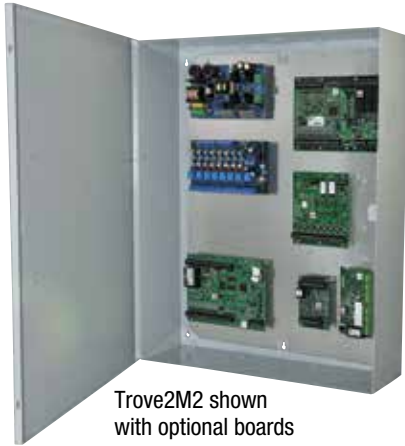
Trove2M2 shown with optional boards

Trove2M2 accommodates various combinations of Mercury boards with or without Altronix power supplies and accessories for access systems.