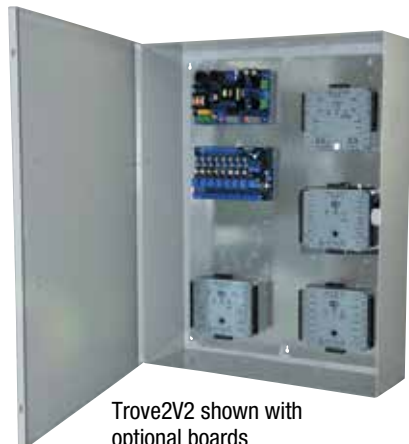
Trove2V2 shown with optional boards

Trove2V2 accommodates various combinations of Vertx boards with or without Altronix power supplies and accessories for access systems.