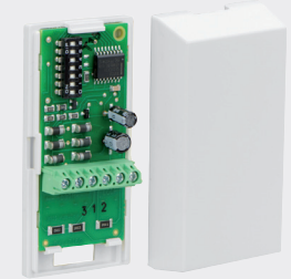
POPIT Module D9127U/T

Use the serial number located on the product label and refer to the Bosch Security Systems, Inc. website at http://www.boschsecurity.com/datecodes/ .