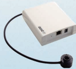
DF Series Features a Full HD Pinhole IP Camera (3.7mm - ZN1-V4FN4 or 2.8mm ZN1-V4FN4)