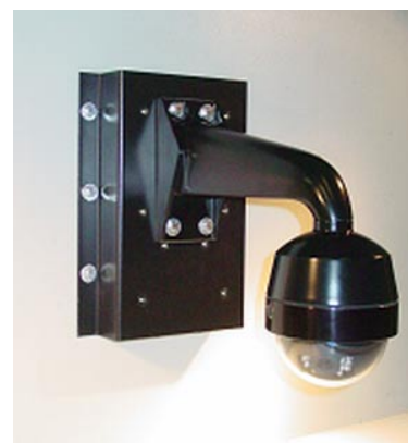
The EXMB.017 Wall Mount Adaptor Bracket shown with Dome Pendant Bracket EXMB.045