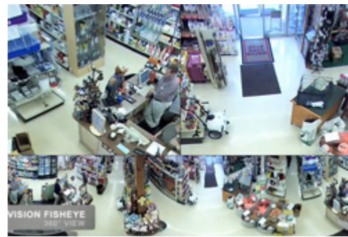
Dewarped Image: 2 PTZ views & 1 360 degree view