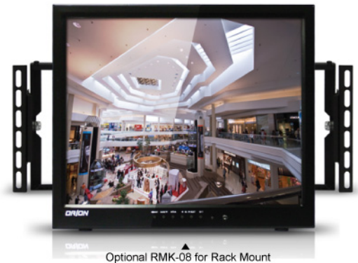
Optional RMK-08 for Rack Mount