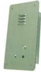
Model AB731A-F Shown

The AB731A-F is for flush mounting and comes with a light duty backbox for EMC protection. When an optional backbox is needed for concrete mounting, the model BBF731 must be ordered.