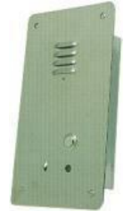
Model AB731-F Shown

The AB731-F is for flush mounting and comes with a light duty backbox for EMC protection. When an optional backbox is needed for concrete mounting, the model BBF731 must be ordered.