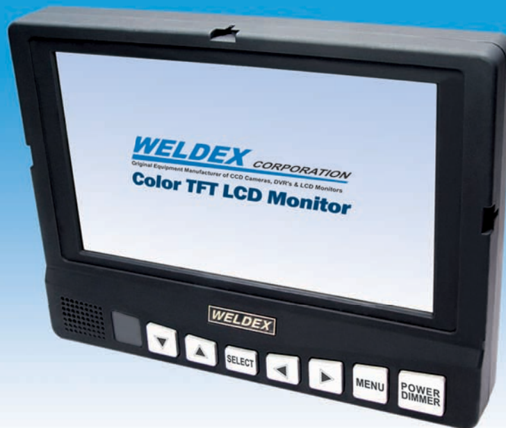
WDL-8001M / WDL-8003M