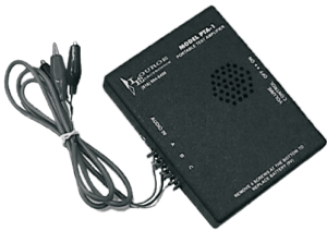
Portable Test Amplifier for use with DG-25III Dim: 3 1/8" W x 4 1/4" H x 1 1/2" D Weight: 5 oz