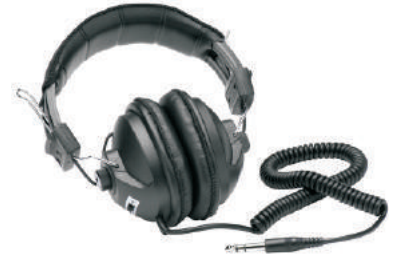
Stereo Headphone 8Ω, 100mW, with 1/4" plug Volume control on each ear