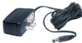
Power Supply Input: 100~240 VAC 50/60 Hz 1.2A Output: +24 VDC, 1.5A