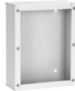
18 Ga Aluminum Back Box for AOP-SP and TLMC-W Dim: 8.12"H x 6.17"W x 4"D