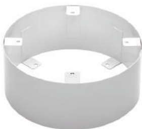
Mounting Ring for TLM-CS Dim: 7.38" Dia. x 3"D