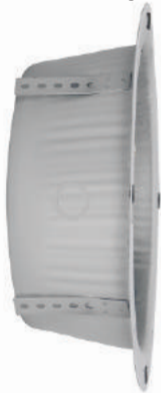
Ceiling mount backbox for TLI-CF Dim: 12.25" Dia. x 4"D