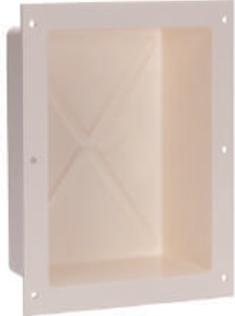
Plastic Back Box of AOP-SP and TLMC for flush mounting Dim: 8"H x 6.25"W x 2.75"D