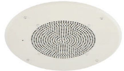
Ceiling Flush Speaker Grill Baffle for TLI-CF with 8" speaker Dim: 12.87" Dia.