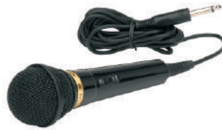
Low Impedance Handheld Microphone 600Ω