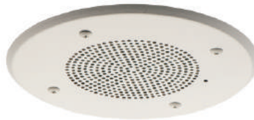
Ceiling Flush Speaker Grill Baffle for TLM-CF with 4" speaker Dim: 7.65" Dia.