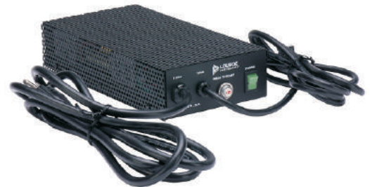
DG-12II and DG-25III Power Supply Input: 100~240 VAC 50/60 Hz 4.5A Output: +15 VDC, 12.3A