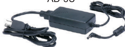
Universal Power Supply 100~240 VAC 50/60 Hz 0.8A +24 VDC, 1A