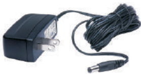
Power Supply Input: 100~240 VAC 50/60 Hz 0.3A Output: +12 VDC, 500mA