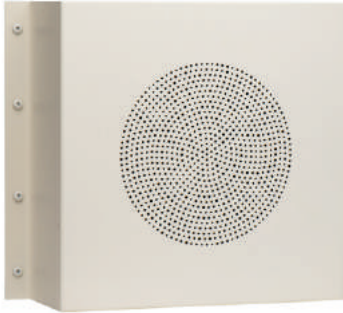
Square Surface Mount Vandal Resistant Baffle Dim: 11"H x 13"W x 4"D