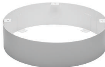
Mounting Ring for TLI-CS Dim: 12.38" Dia. x 3"D