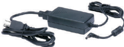
Universal Power Supply Input: 100~240 VAC 50/60 Hz 0.3A Output: +12 VDC, 500mA