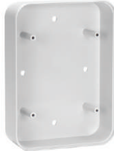
Plastic Back Box for TLM-W Dim: 6.9"H x 5"W x 1.65"D