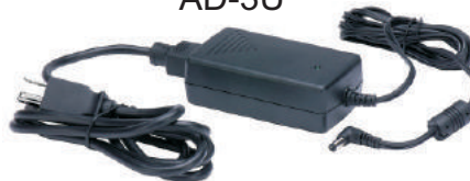
Universal Power Supply 100~240 VAC 50/60 Hz 0.8A +24 VDC, 1A