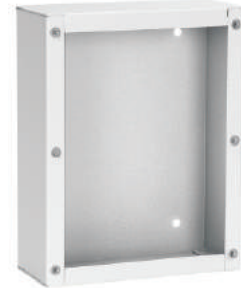
18 Ga Aluminum Back Box for AOP-SP and TLMC-W Dim: 8.12"H x 6.17"W x 4"D