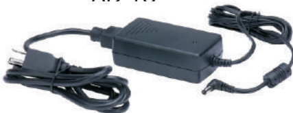
Universal Power Supply Input: 100~240 VAC 50/60 Hz 0.3A Output: +12 VDC, 500mA