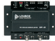
IF-2 AUDIO INTERFACE ADAPTER (two audio inputs and outputs)

After all microphones have been connected, bring other end of wiring to the IF-2/IF-4/IF-8 location and connect each microphone to the terminal blocks of the unit marked A, B, C. Be sure to properly match wire colors. If using cable from other manufacturers, color code may vary.