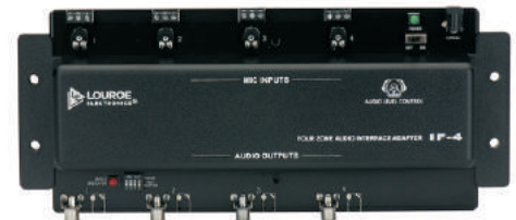
IF-4 AUDIO INTERFACE ADAPTER (four audio inputs and outputs)