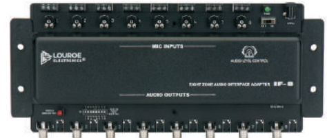
IF-8 AUDIO INTERFACE ADAPTER (eight audio inputs and outputs)