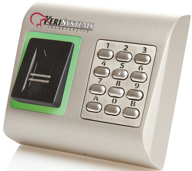
B100-SKP-SA Swipe-Fingerprint + PIN

Keri's B100-SKP-SA™ Readers provide reliable swipe- fingerprint reading in attractive and unobtrusive packages. Typically for small and medium installations, these readers can be used in residential areas, homes, offices, gate automations and other applications where high security is needed but simple installation is required.