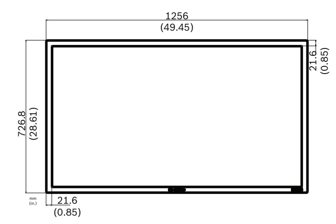
UML-553-90: Front View