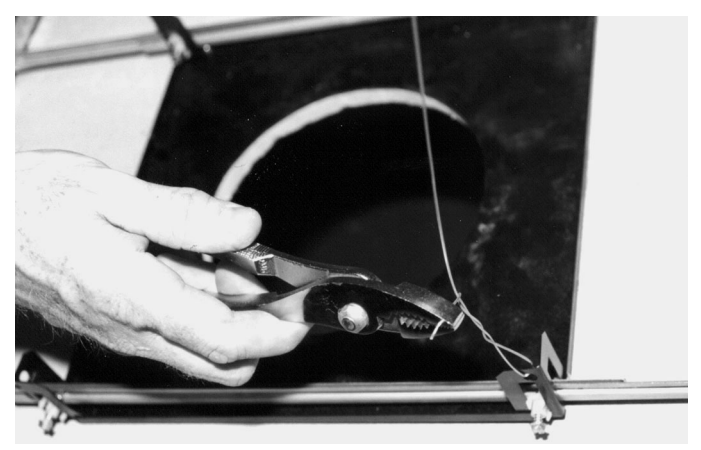
Figure 3.4 Secure Bracket Assembly

6. Secure the Bracket Assembly to an overhead securing point with a safety wire.