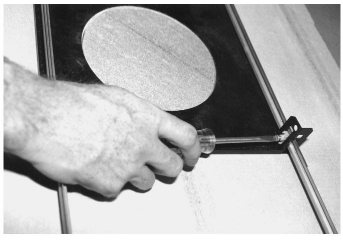
Figure 3.3 Tighten Bracket Securing Screw

5. Tighten the four (4) securing screws to the Bracket Assembly.