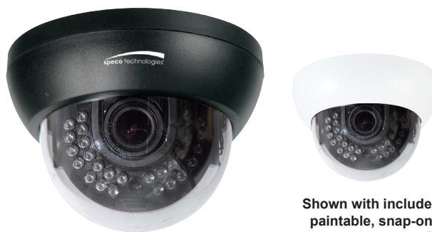
Shown with included paintable, snap-on Chameleon Cover™