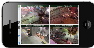
Remote Viewing with Internet Explorer and Apps Available for iPhone, iPad, & Android Devices