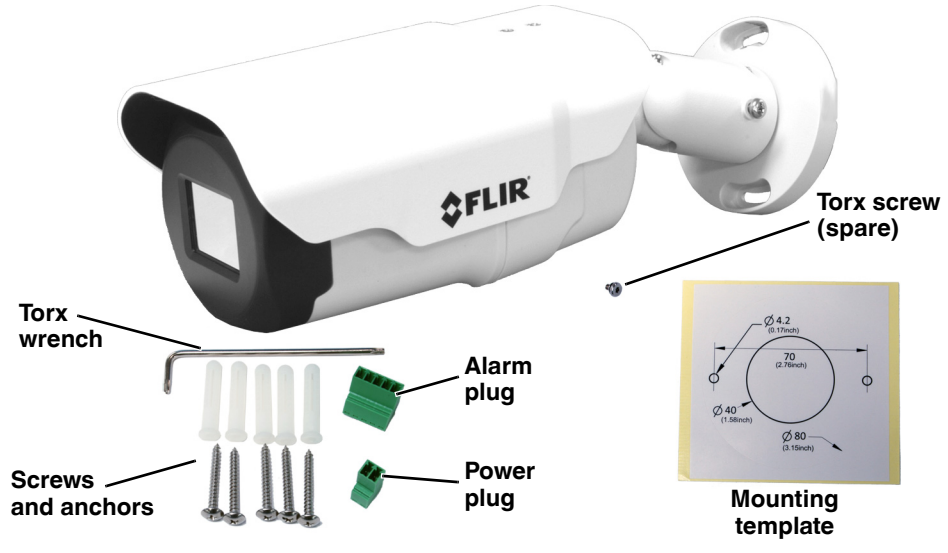
Items Included in Kit