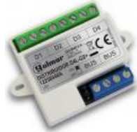
D4L-G2/SMALL 4-way video bus splitters (qty. of 0 to 3 depending upon kit selected)