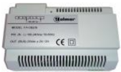
(1) FA-G2 System Power Supply/Amplifier