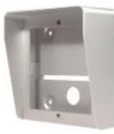
(1) Surface aluminum back box with standard rainhood for the NEXA panel (model# N871/AL shown)