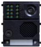
(1) EL632/G2SE Camera and Speaker/Mic. Module (installed into the NEXA panel)