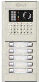
(1) Aluminum NEXA Door Station (supplied with SURFACE back back box), with 1 to 10 push-buttons. 10-Button model shown