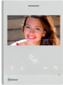
ART4LITE/G2 Surface Mount 4.3" Indoor Video-Intercom Monitors (qty. of 1 to 10 depending upon kit selected)