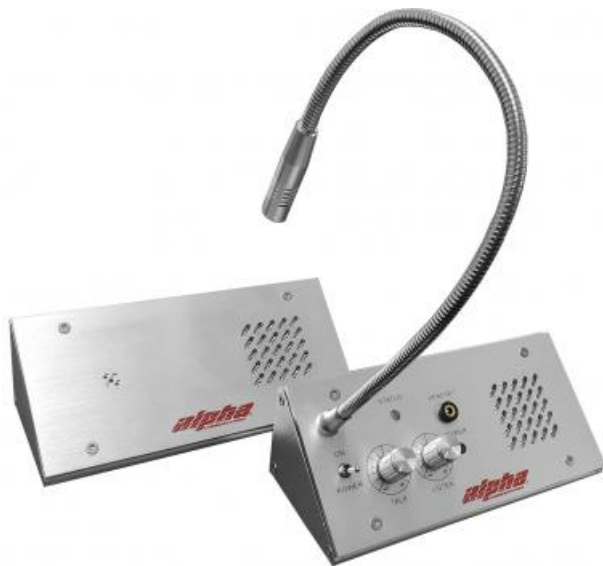
SC-300 Counter-Top Ticket Window Intercom System